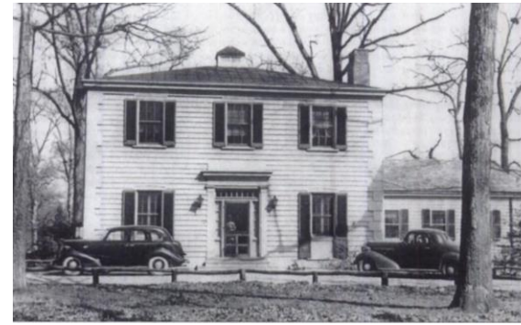
Remodeled Jesup Blair House, 900 Jesup Blair Drive. The photo is from the 1940s.