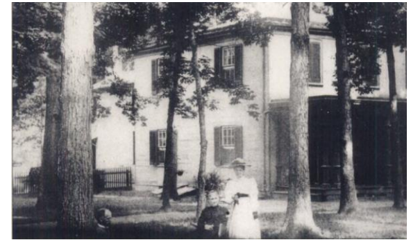
"The Moorings" c.1870; now called Jesup Blair House

Historical Jewel in the Heart of Silver Spring